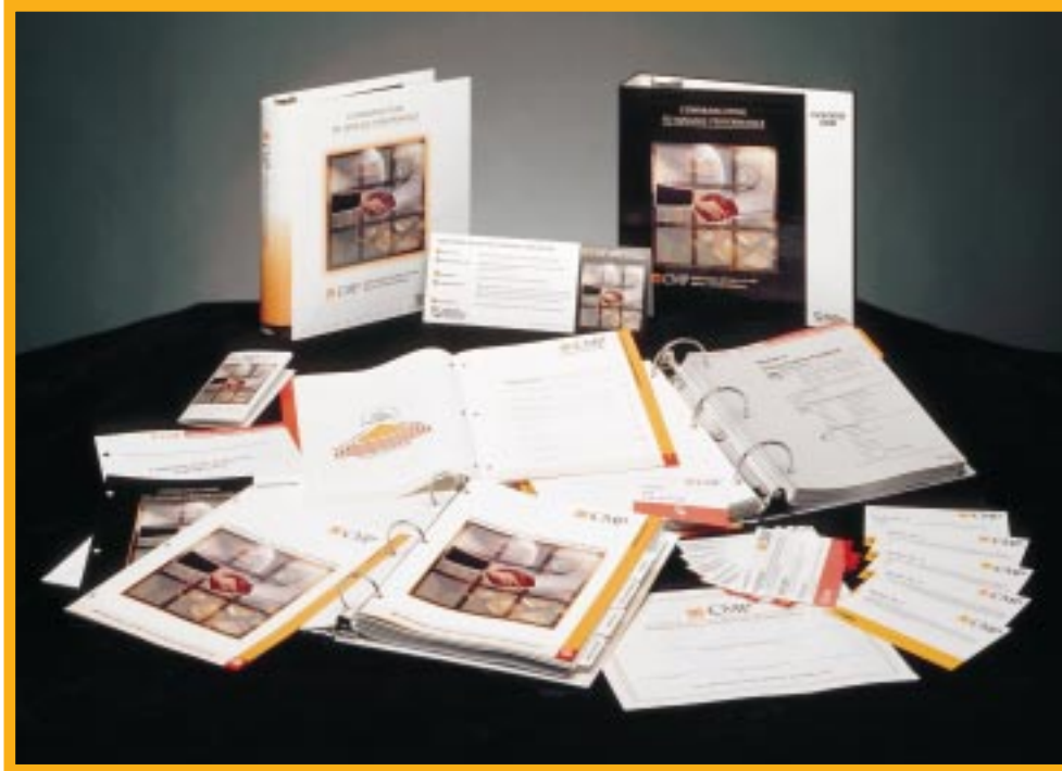
CMP course material

The CMP course material is comprehensive and is rich in activities and exercises that let participants rehearse successful interactions relevant to their own job requirements.