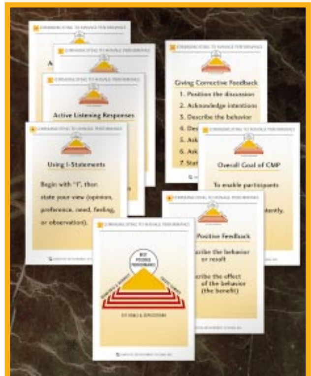
CMP wall charts